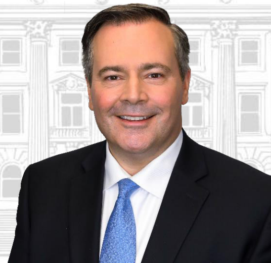
Hon Jason Kenney, Premier of Alberta

A blue ink signature of Jason Kenney, written over a horizontal line.