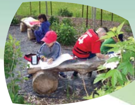
Students, teachers and community volunteers learn about sustainable landscapes at the Riverdale Elementary School "naturescape."